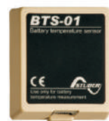
BTS -01 Battery temperature sensor