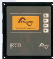
RCC -03 Remote control and programming center (Panel mounted)