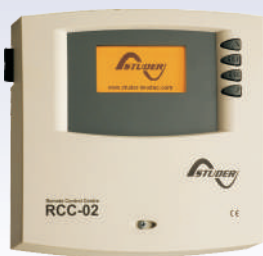
RCC -02 Remote control and programming center (Wall mounted)