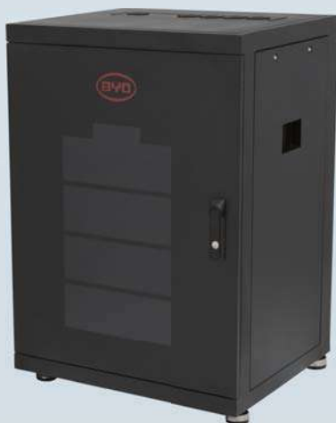
B-Box Pro 2.5~10.0