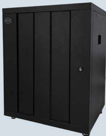
B-Box Pro 13.8